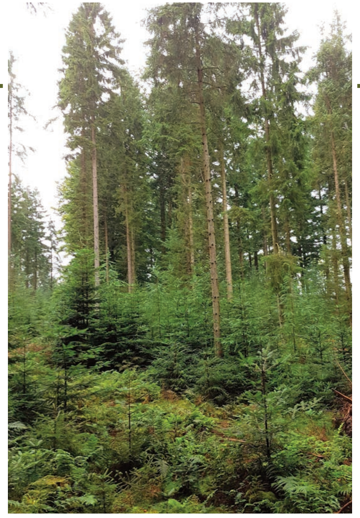
Interest in CCF is international. Transformation to CCF in a private forest of Norway spruce and grand fir in Jutland, Denmark. The stand was originally planted in the 1930s and is being transformed using the profuse natural regeneration.

homogenous even-aged forests composed of few species and typically managed by clear felling and replanting which characterise conventional rotational forest management (RFM). These alternative approaches have different names such as 'ecological forestry' (USA), 'close-to-nature forestry' (central Europe), 'natural disturbance-based management' (Canada) or 'retention forestry' (Chile). However, all share certain silvicultural principles, namely: the avoidance of clear-felling with an emphasis on partial harvesting; a preference for natural regeneration where possible; the development of structural diversity within stands, generally at very intimate scales; the fostering of mixed species stands; and the avoidance of intensive site management practices (Puettmann et al., 2015).