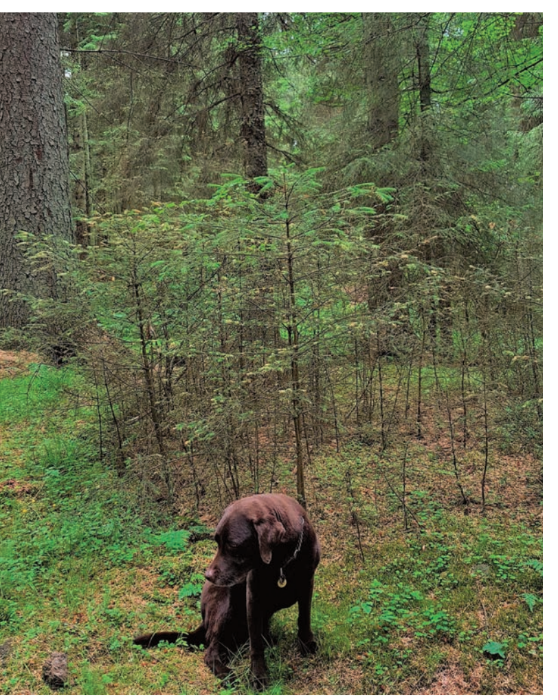
It is important to understand the light requirements of regenerating species. This example from Blairadam forest in Fife shows a group of advance natural regeneration of Sitka spruce dying because of a lack of light and Elatobium defoliation.

Successful implementation of CCF requires evaluating a potential site and considering features that might influence the introduction of an irregular silvicultural system. An early attempt to rank site suitability for CCF combined wind risk, site fertility and potential vegetation competition, and species suitability into a framework that classed sites as having good, moderate or poor suitability (Mason and Kerr, 2004). This resulted in the view that "the older the stand, the